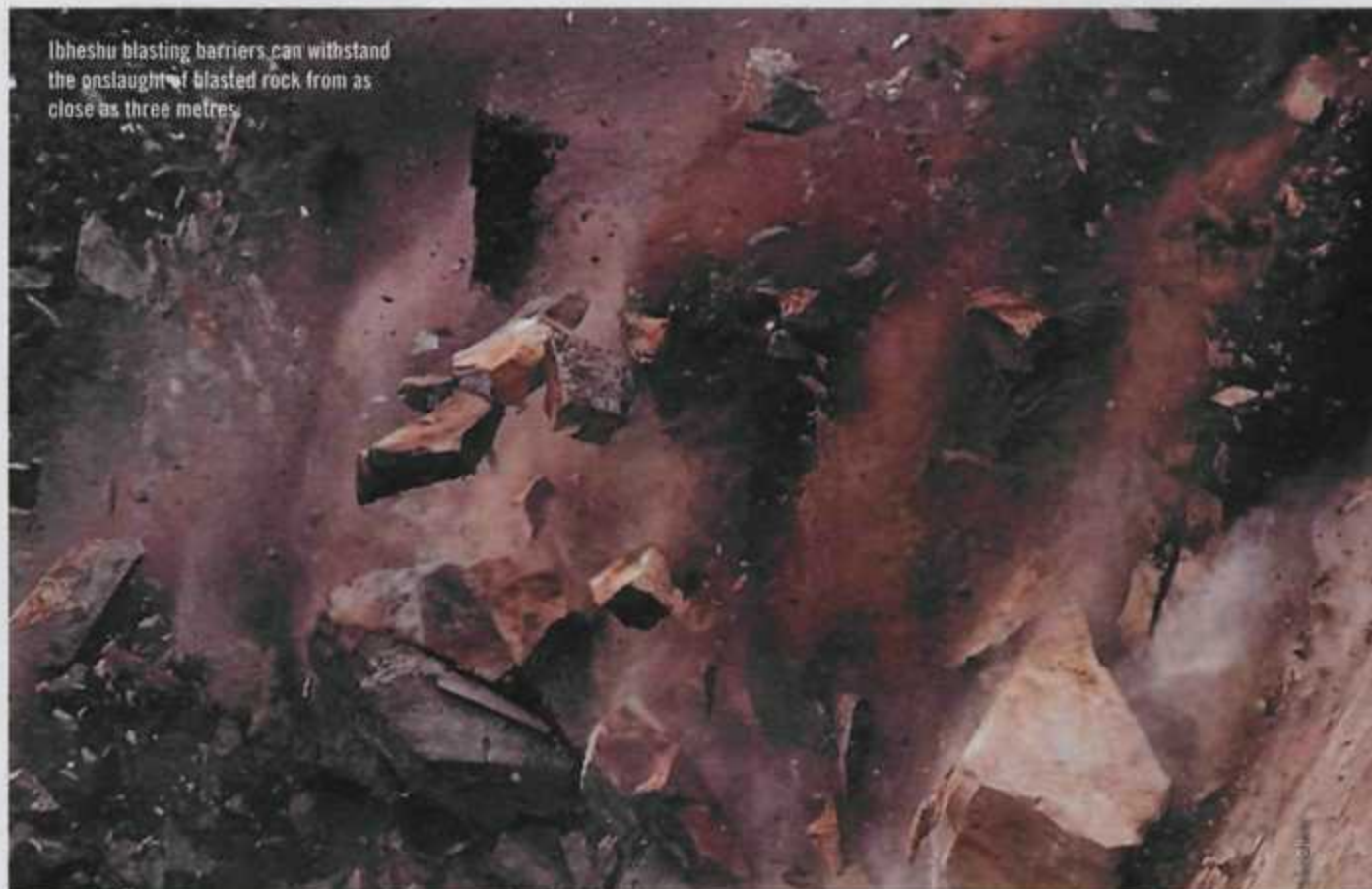
Ibhesu blasting barriers can withstand the onslaught of blasted rock from as close as three metres.

Blasting rock in a tight space can be tricky, especially when the surrounding rock walls are full of valuable ore. Mining Mirror takes a look at the best ways of containing a blast underground.